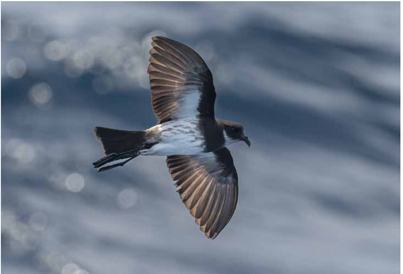
Figure 5. Polynesian Storm-Petrel Nesofregatta fuliginosa , 27 April 2022, day 2 sailing west-southwest from Kiritimati toward the Phoenix Islands (Kirk Zufelt). A main goal for the expedition was to photograph at sea the colour variations of Polynesian Storm-Petrel shown in Figure 124 in King (1974). The heavily streaked and dark-morph variants have not been photographed at sea. The hope was that the catastrophic decline of the species in the Phoenix Islands caused by introduced invasive mammals (reported by Pierce et al. 2006) had been reversed following successful eradication carried out in 2008 (reported by Pierce et al. 2011). Notwithstanding the conservation efforts, we found few Polynesian Storm-Petrels in the environs of the Phoenix Islands, no dark-morph bird, with the most strongly dark-streaked bird shown here. In addition to the breast and flank streaks, the bird’s white ‘cut-throat’ was reduced in size and streaked, the feathering above the thighs was dark smudged, and the white uppertail-coverts had large dark centres. Some other birds were more lightly streaked.

Conservation Endangered (IUCN Red List of Threatened Species) with numerous historically extinct populations. Continuation of conservation programs on Kiritimati and in Phoenix Islands vital to prevent extirpation from region. Numbers in Phoenix Islands, in particular McKean Island, apparently remain critically low.