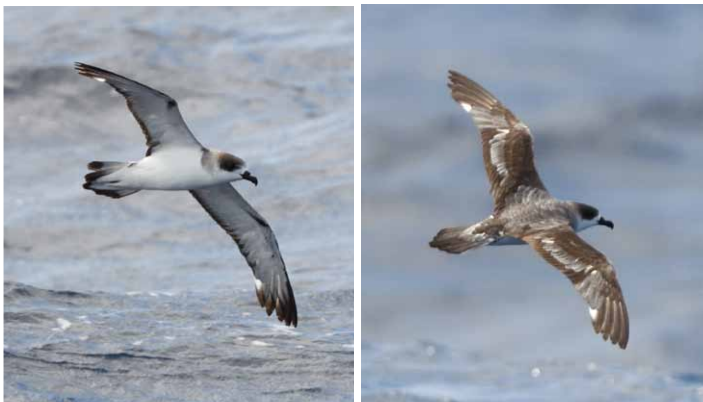
Figure 10. Juan Fernández Petrel Pterodroma externa , 21 April 2022, day 4 sailing south from Hawaii to Kiritimati. Three of the eight birds seen during the expedition were in primary moult. They were non-breeding birds based on the breeding season, December–May; age classification possibilities are a juvenile progressed into second basic moult, an adult failed breeder, or an adult on a sabbatical year.

Conservation Vulnerable (IUCN Red List of Threatened Species).