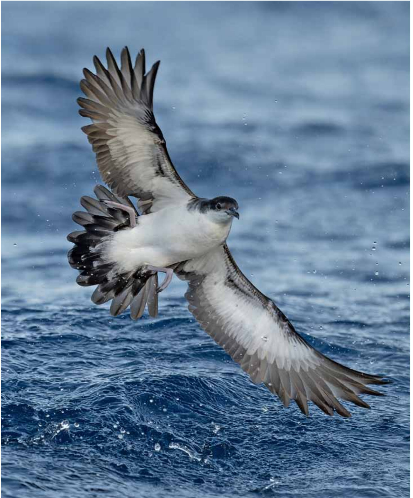
Figure 28. Micronesian Shearwater Puffinus dichrous , 1 May 2022, off Rawaki, Phoenix Islands (Kirk Zufelt).

Conservation Least Concern (IUCN Red List of Threatened Species) treating all forms as ‘Tropical Shearwater’. Urgent need for clearer understanding of taxonomy and thereafter conservation requirements.