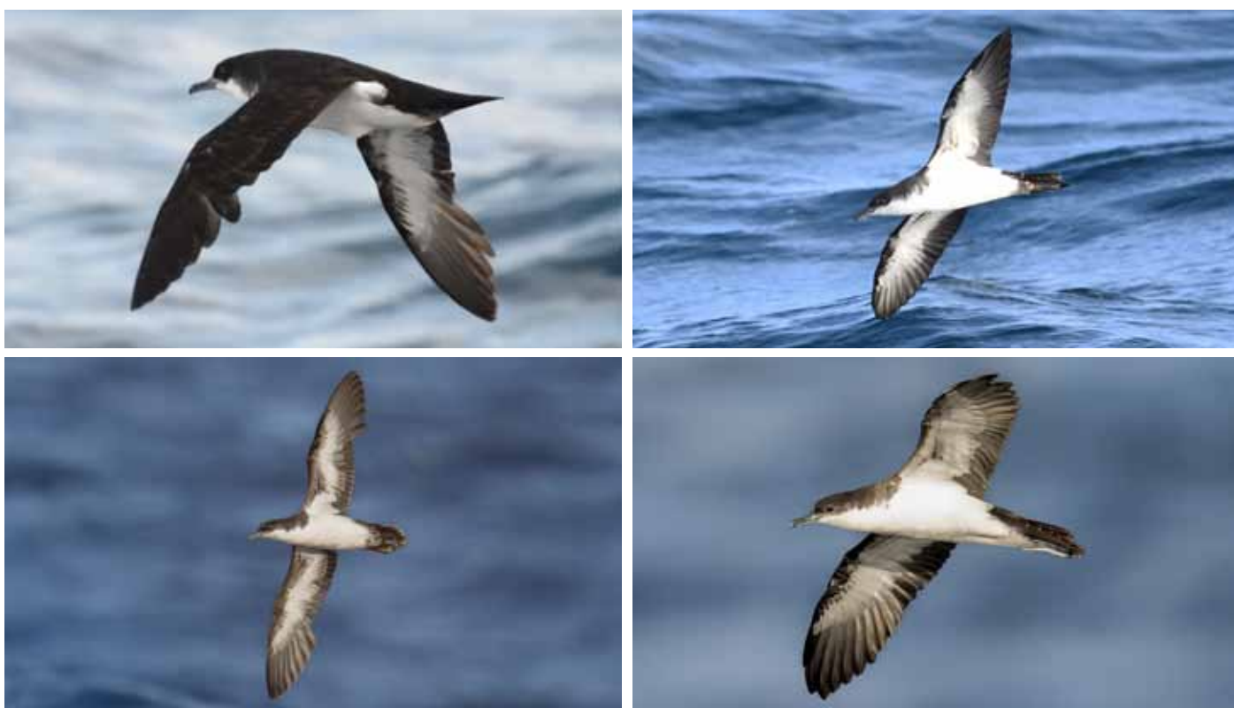
Figure 34. Examples of Puffinus shearwaters in primary moult from current expedition. Top row Kiritimati, bottom row Rawaki. All stages of primary moult found at both island locations.