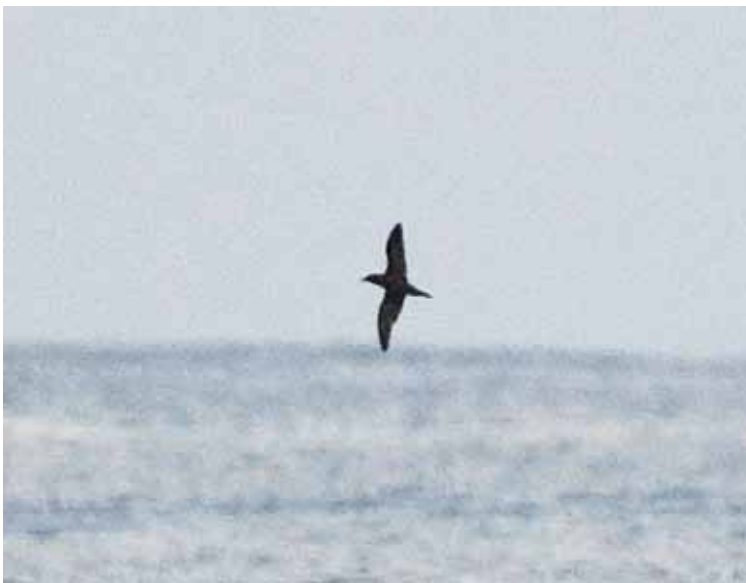
Figure 21. Fiji Petrel Pseudobulweria macgillivrayi , 30 May 2022, off Gau, Fiji (Hiroyuki Tanoi).

Recognition Fiji Petrel closely related to Tahiti and Beck's Petrels, having same overall shape, though plumage all-dark and overall size evidently smaller. Detailed discussion about ID in Shirihai et al. (2009).