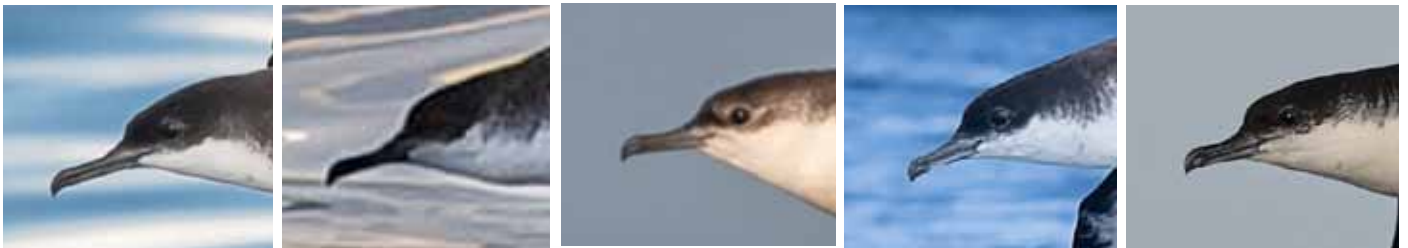
Figure 29. Comparison of bill lengths of Puffinus shearwaters from recent expeditions in western and central Pacific. From left to right, birds from Tahiti, Tonga, Marquesas, Kiritimati, and Rawaki (Kirk Zufelt). Longest bills on birds off Tahiti and Tonga (Polynesia), shortest bills on birds off Kiritimati and Rawaki (Micronesia). Quite short bills on birds from Marquesas (Polynesia). Taxonomy of Pacific Puffinus shearwaters not resolved.