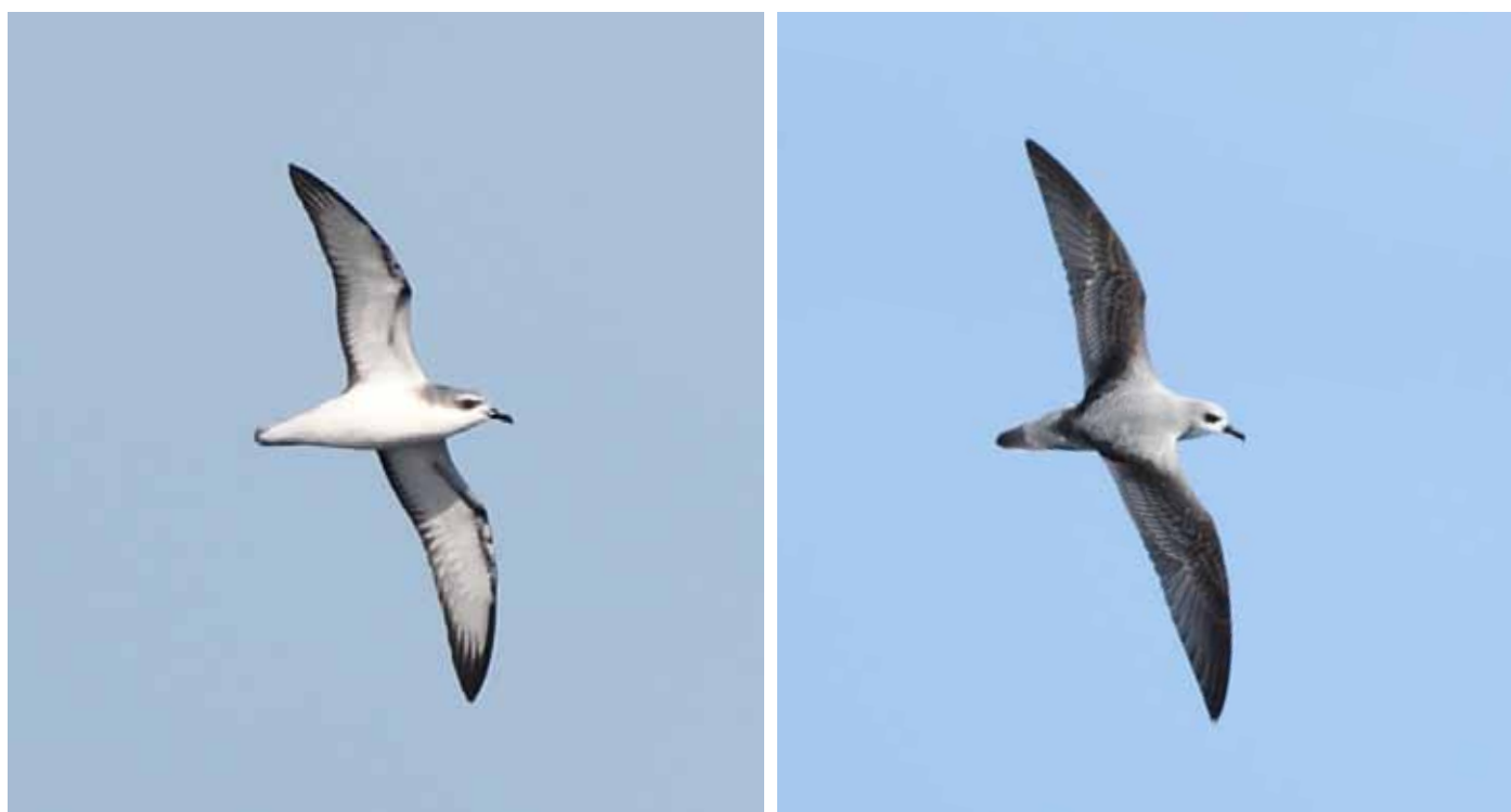
Figure 19. Cook's Petrels Pterodroma cookii , 5 May 2022 (left), off McKean Island, Phoenix Islands; 17 May 2022 (right), off Taveuni Island, Fiji. Occasionally encountered throughout the expedition.

Conservation Vulnerable (IUCN Red List of Threatened Species). Significant population recovery following conservation efforts at breeding colonies, justifying change in status from Endangered to Vulnerable (Rayner et al. 2007, 2008).