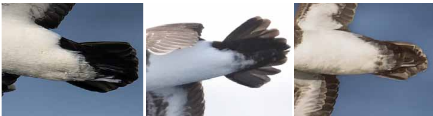
Figure 32. Undertail-coverts of Puffinus shearwaters from current expedition. Left and centre from Rawaki, right Kiritimati ( Kirk Zufelt ). In all cases, lateral undertail-coverts dark. Some variation found in undertail-coverts at Rawaki, from clean-white (left) to some dark smudgy markings (centre). Variation in undertail-coverts at Kiritimati ranged from clean-white to substantial dark smudgy markings (right).