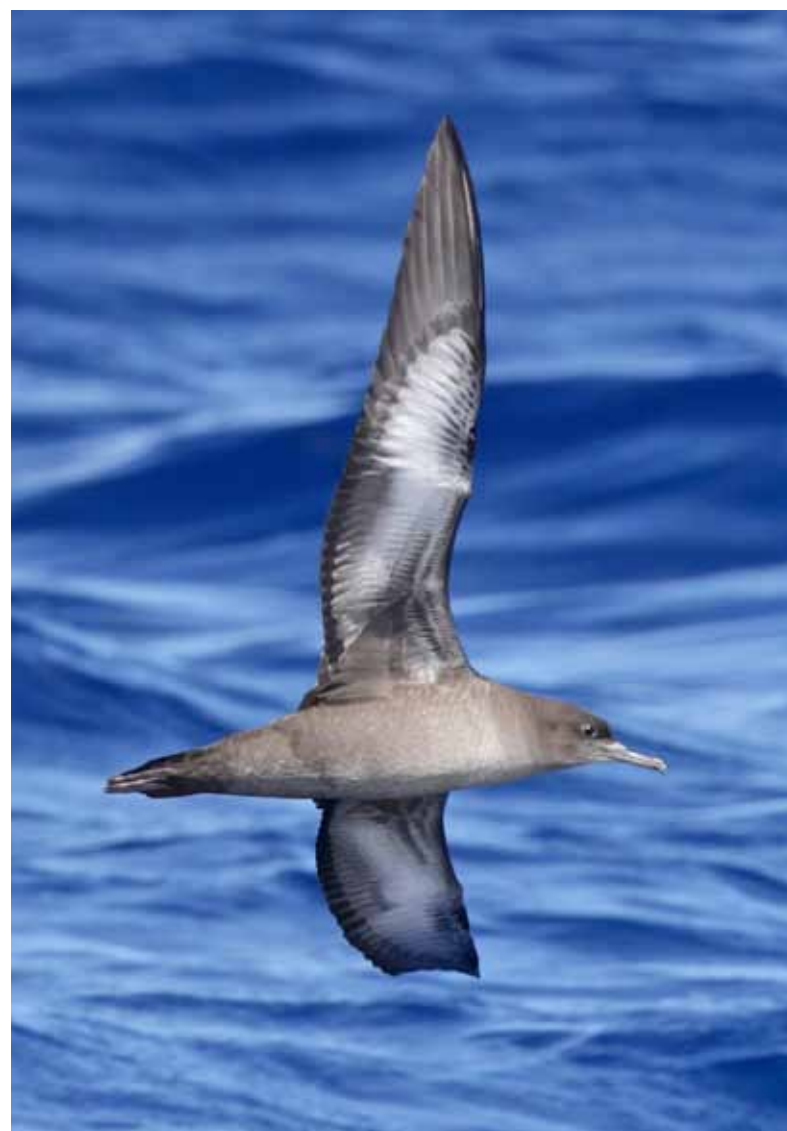
Figure 25. Sooty Shearwater Ardenna grisea , 25 May 2022, off Gau, Fiji. Observed most days in small numbers as birds headed northwards in the early stages of a clockwise transequatorial migration ‘around’ the Pacific. All birds were carefully checked for Short-tailed Shearwater A. tenuirostris and no candidate was seen indicating that Short-tailed follows a different route / timing in its migration.

Recognition Separation of Sooty Shearwater from Short-tailed Shearwater A. tenuirostris is notoriously difficult (basic separation criteria in Howell & Zufelt 2019, detailed separation criteria in Flood & Fisher 2020). Sooty tends to have more athletic build, long narrow wings, and powerful flight, Short-tailed more compact with dashing flight. Typically, Sooty has high contrast between whitish in underwing-coverts and blackish under primaries, more subdued Short-tailed, but some Sooty have wholly dark underwing-coverts. Rule of thumb, under primary coverts paler than under secondary coverts in Sooty, reverse of Short-tailed. Sooty uniquely has contrasting dark shafts to greater primary coverts. Short-tailed bill shorter with longer nasal tubes as proportion of bill.