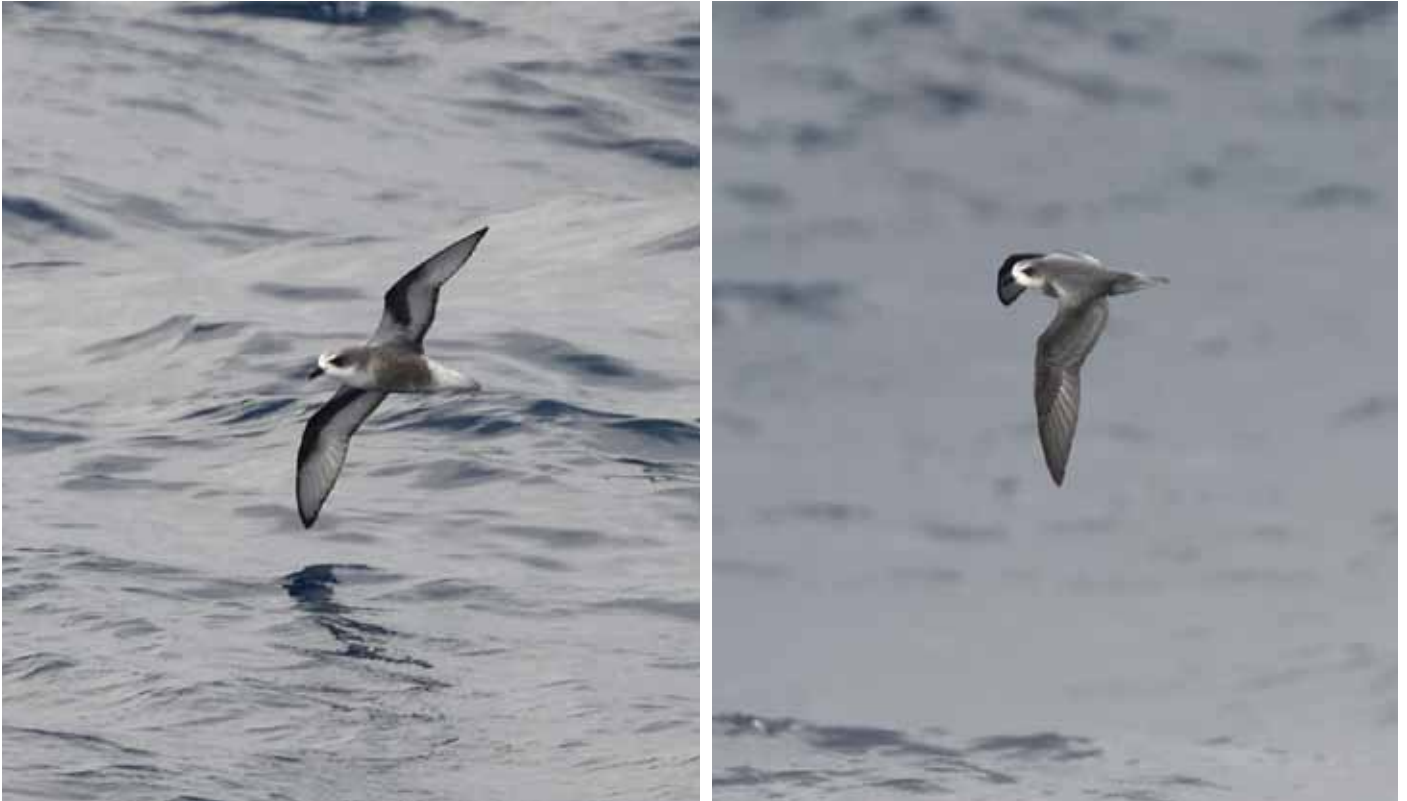
Figure 16. Mottled Petrels Pterodroma inexpectata , 27 May 2022, off Gau, Fiji (Hiroyuki Tanoi).

Conservation Near Threatened (IUCN Red List of Threatened Species). Entire expanse of water covered during expedition clearly crucial to species' migration, though little evidence of foraging and feeding, indicating birds on rapid transit to more productive northern waters.