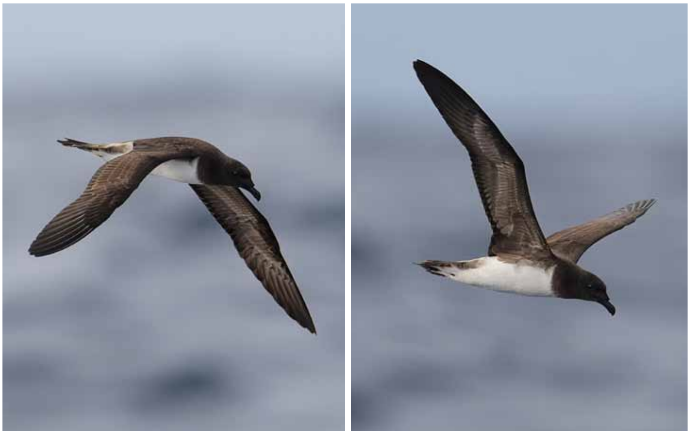
Figure 20. Presumed Beck's Petrel Pseudobulweria becki , 23 April 2022, ca. 180 km north of Kiritimati, ca. 4.15°N (Kirk Zufelt). The first truly oceanic record of this species away from the breeding grounds.

Conservation Critically Endangered (IUCN Red List of Threatened Species). The sighting north of Kiritimati gives the first indication of waters used by and thus important to the species.