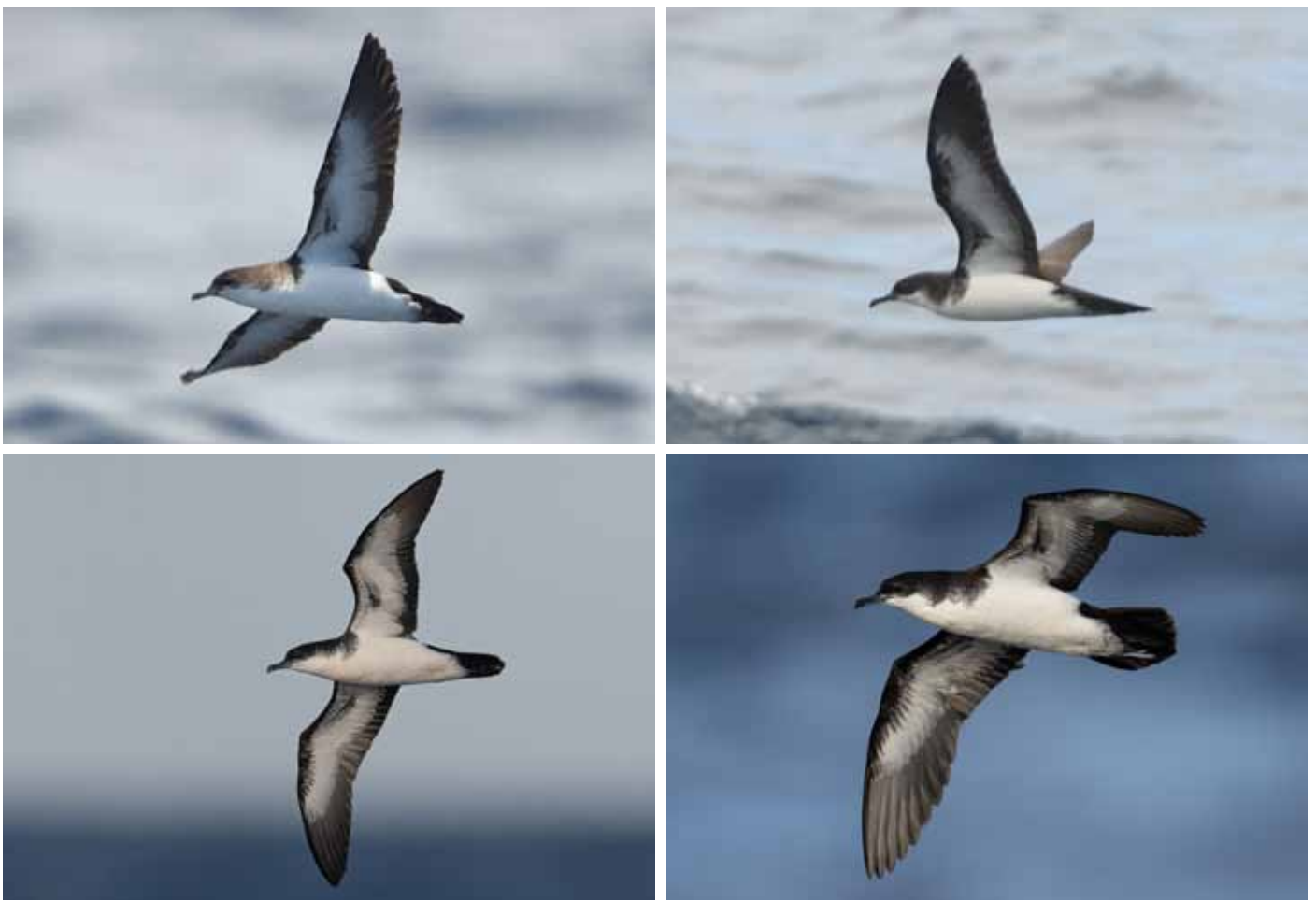
Figure 31. Underwing-coverts of Puffinus shearwaters from current expedition. Top row Kiritimati, bottom row Rawaki. Variation in extent of dark markings apparently greater at Kiritimati.