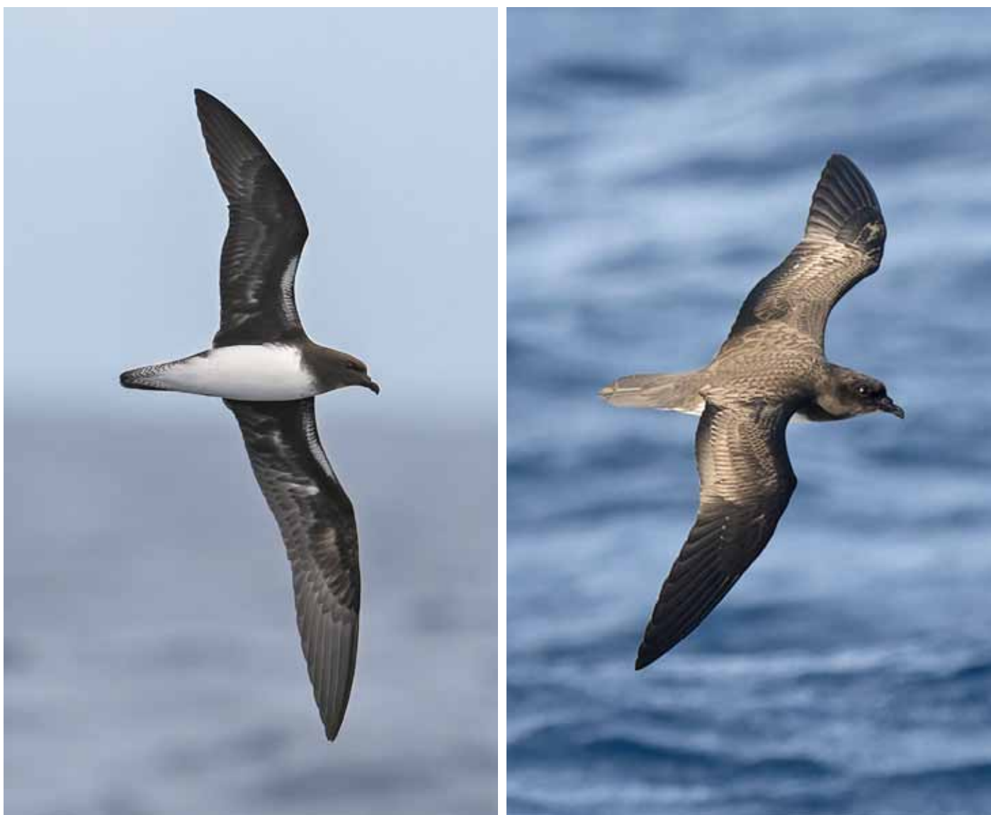
Figure 14. Phoenix Petrels Pterodroma heraldica , 22–24 April 2022, on approach to Kiritimati (Kirk Zufelt).