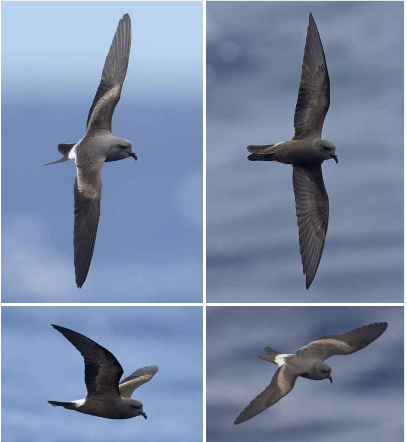
Figure 8. Leach's Storm-Petrels Hydrobates leucorhous , 18–20 April 2022, south of Hawaii (Kirk Zufelt).

Recognition See Band-rumped Storm-Petrel. Detailed description Flood & Fisher (2013a).