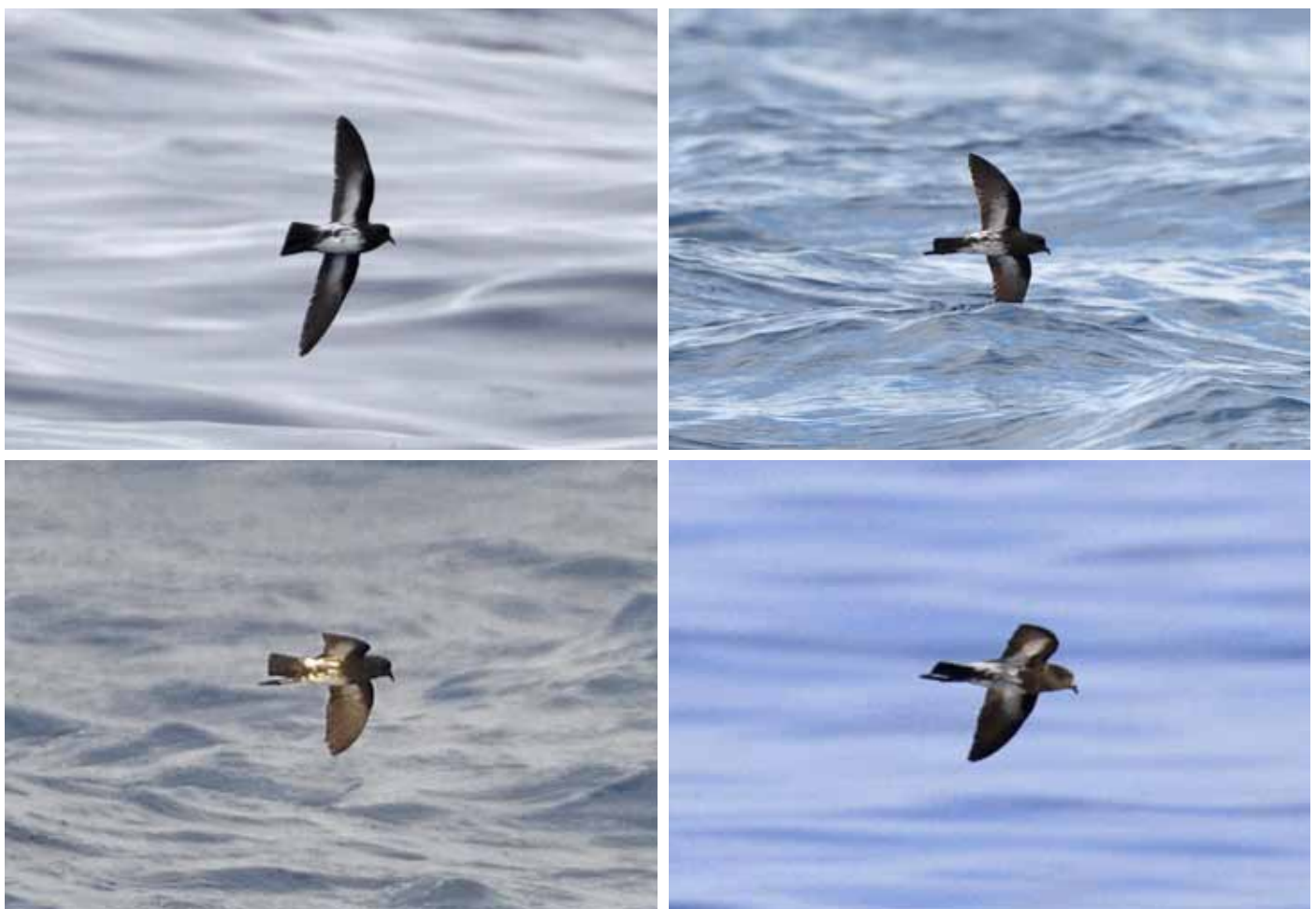
Figure 4. New Zealand Storm-Petrels Fregetta maoriana , 29–30 May 2022, off Gau Island, Fiji (top left and bottom right Mike Danzenbaker, others Hiroyuki Tanoi). In chronological order from top left to bottom right.

Conservation Listed as Critically Endangered (IUCN Red List of Threatened Species). Range away from New Zealand virtually unknown, so Fiji waters must immediately be considered of high importance to species.