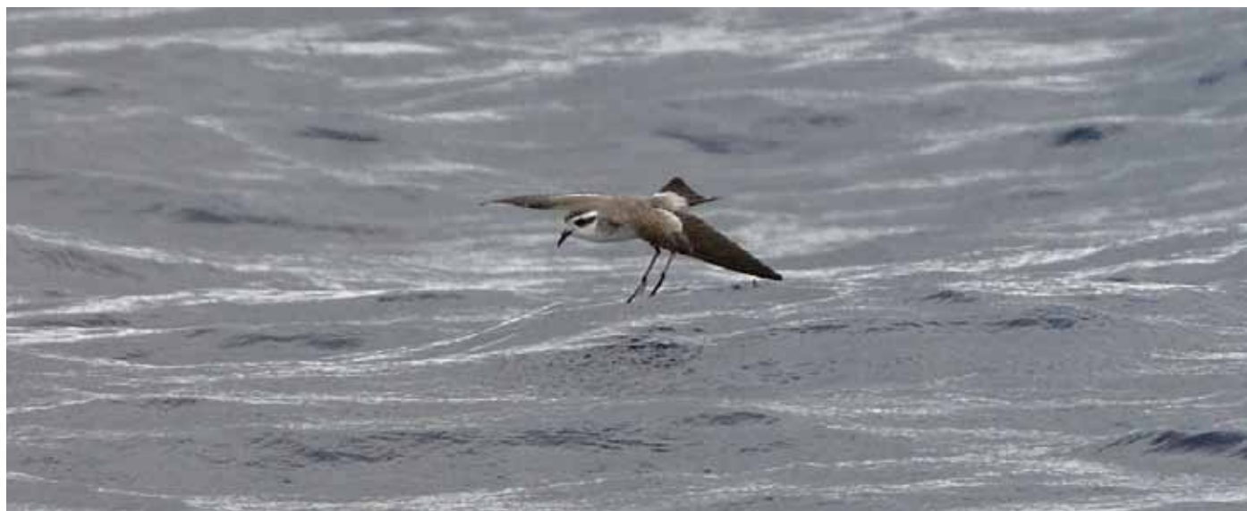
Figure 2. White-faced Storm-Petrel Pelagodroma marina , 27 May 2022, off Gau Island, Fiji.

Conservation Least Concern (IUCN Red List of Threatened Species).