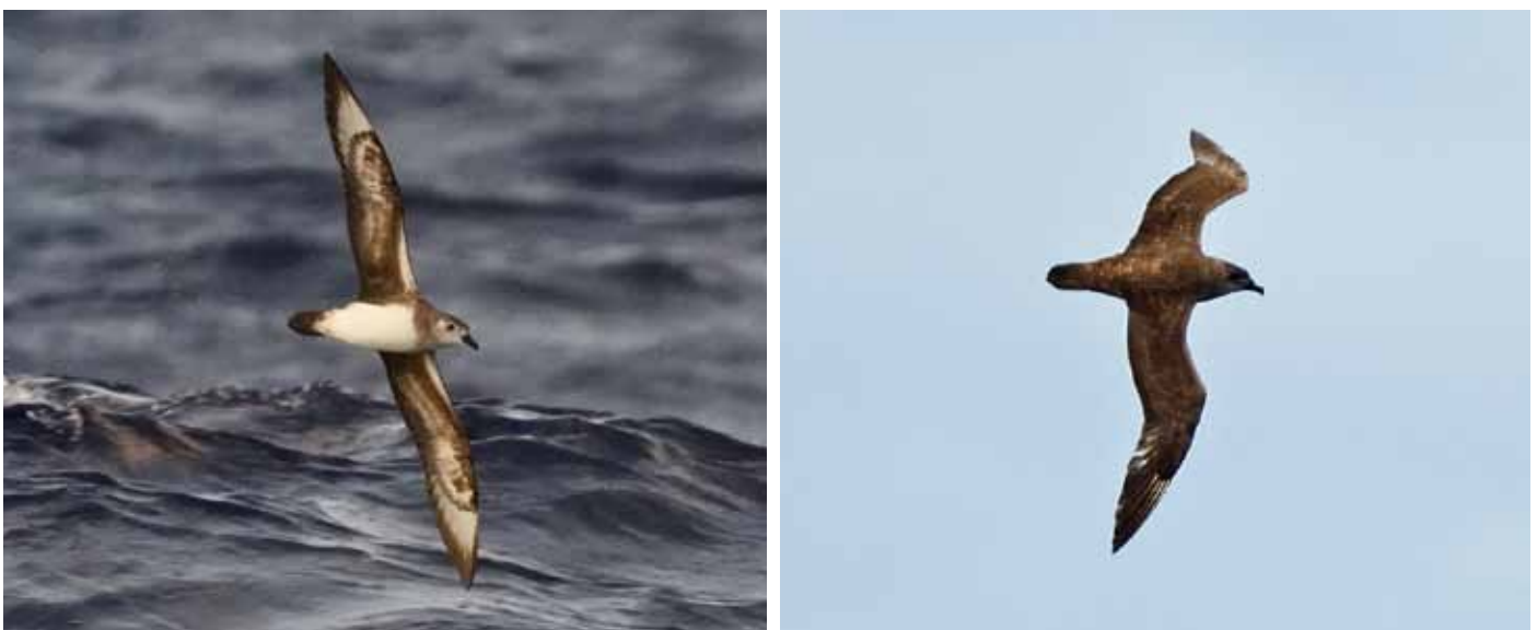
Figure 12. Kermadec Petrels Pterodroma neglecta, 11–12 May 2022, Niuafu‘ou, Tonga environs. As expected, small numbers observed at various points over the course of the expedition.

Conservation Least Concern (IUCN Red List of Threatened Species).