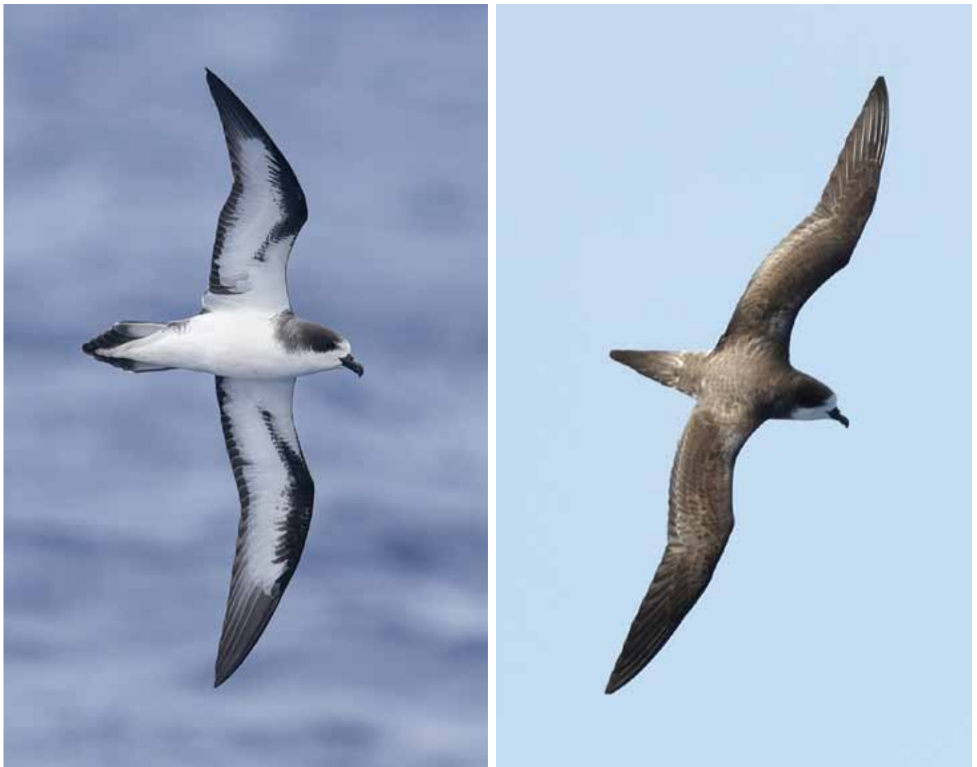
Figure 15. Hawaiian Petrels Pterodroma sandwichensis , 22–24 April 2022, south of Hawaii. Regular during sail from Hawaii to Kiritimati until reaching doldrums north of Kiritimati.

Conservation Vulnerable (IUCN Red List of Threatened Species). Phoenix Petrel has suffered concerning population declines, catastrophic in Phoenix Islands, leaving Kiritimati and Marquesas Islands the important strongholds, albeit that they too have experienced a declining population.