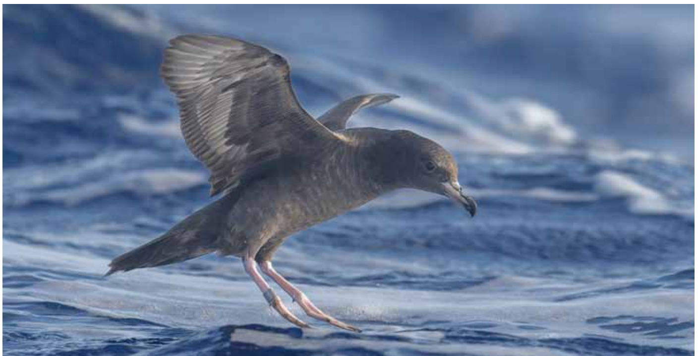
Figure 26. Flesh-footed Shearwater Ardenna carneipes , 19 April 2022, day 2 sailing south from Hawaii to Kiritimati (Kirk Zufelt). Metal band number: Z-66192. Date banded: 12/12/2016. Age/Sex at first marking: Adult (3+)/ Female. Banding location: Ohinau Island, New Zealand. Latitude/Longitude: -36.7254 / 175.8783.

Conservation Near Threatened (IUCN Red List of Threatened Species). Evidence of widespread decline (Priddel et al. 2006, Jamieson & Waugh 2015). Passage through Phoenix Islands recently discovered (Pierce et al. 2006) demonstrating importance of region for species.