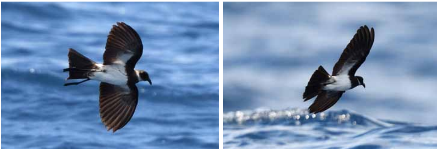
Figure 6. Polynesian Storm-Petrels Nesofregatta fuliginosa , 23 April 2022, off Kiritimati. Many birds off Kiritimati and Phoenix Islands had narrow white ‘cut throat’, light streaking on breast and flanks, largely dark under primary coverts and undertail-coverts, and marked uppertail-coverts (latter not shown here).