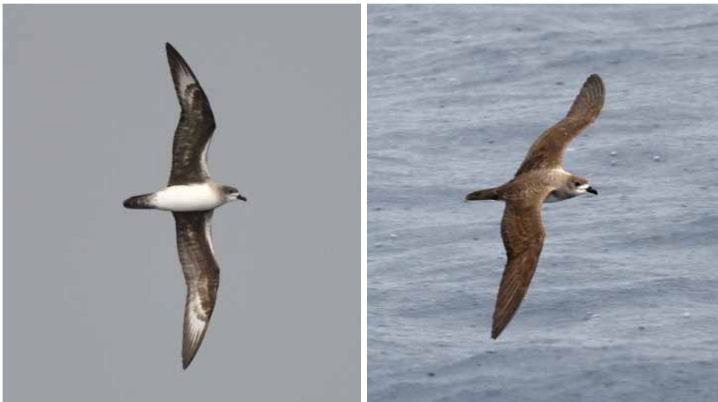
Figure 13. Herald Petrel Pterodroma heraldica , 27 May 2022, off Gau, Fiji (Hiroyuki Tanoi).