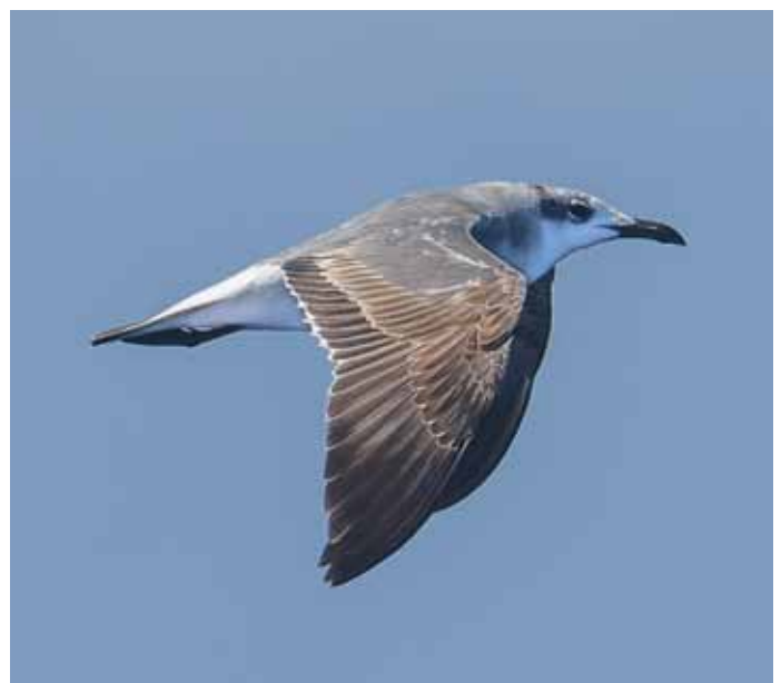
Figure 38. South Polar Skua Stercorarius maccormicki ( Hiroyuki Tanoi ). Just two birds during expedition. Figure 39. Laughing Gull Leucophaeus atricilla ( Kirk Zufelt ). Ca. 4,500 km west of non-breeding range.