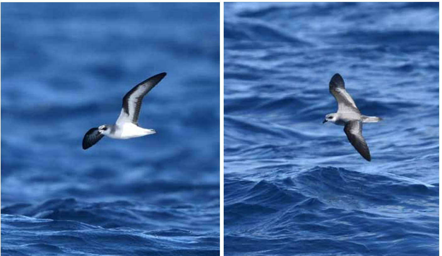
Figure 17. Black-winged Petrel Pterodroma nigripennis , 30 May 2022, off Gau, Fiji.