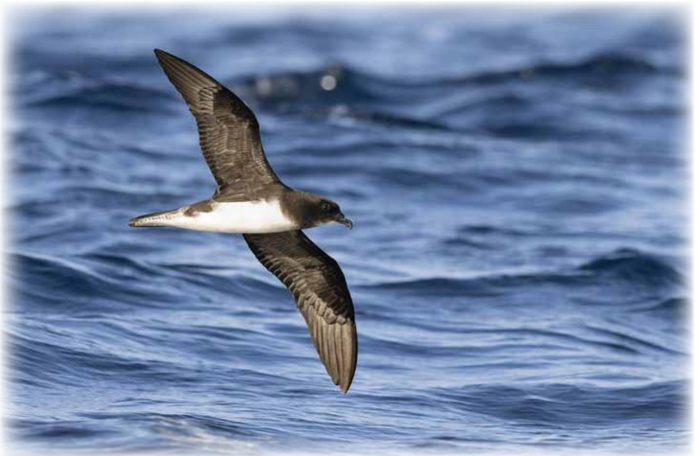
Phoenix Petrel Pterodroma alba , 24 April 2022, off Kiritimati, Kiribati (Kirk Zufelt).