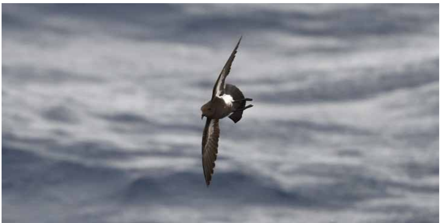
Figure 3. Black-bellied Storm-Petrel Fregetta tropica , 26 May 2022, off Gau Island, Fiji (Hiroyuki Tanoi).

Conservation Listed as Least Concern (IUCN Red List of Threatened Species). Melanesia may be more important to species than previously thought.