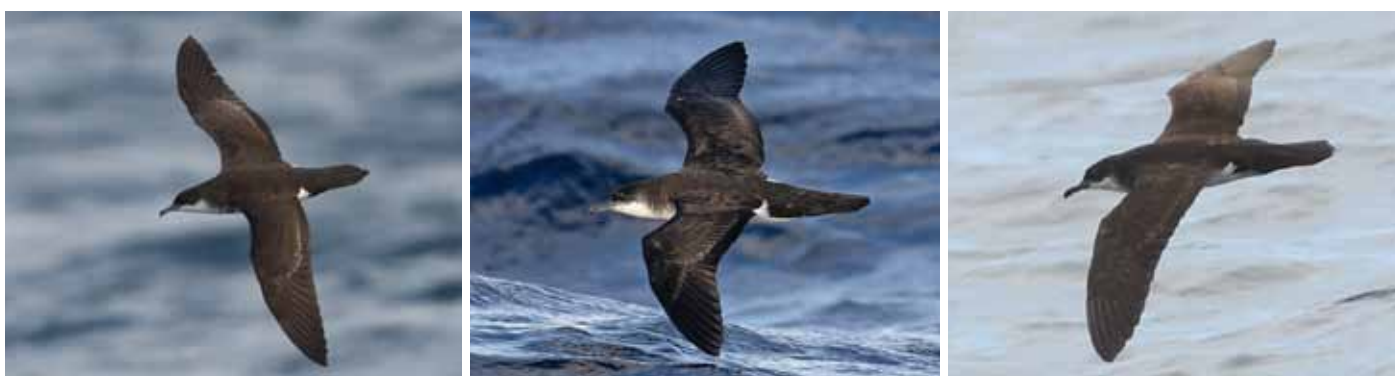
Figure 33. Tips of secondary upperwing-coverts of Puffinus shearwaters from current expedition. Left and right Kiritimati ( Hiroyuki Tanoi ), centre Rawaki ( Kirk Zufelt ). Variation in whitish / buff tips to upperwing greater secondary coverts, from fully whitish-tipped (left), to whitish-tips largely worn away on inner coverts (centre), to whitish-tips mostly worn away and remainder dirty in appearance (right). Freshest plumages had complete set of whitish tips, forming a whitish pencil line across inner wing. Worn plumages had only a hint of remnant buff tips to the outermost greater secondary coverts. Many were intermediate. Ages of birds unknown.