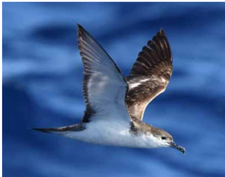
Figure 24. Buller's Shearwater Ardenna bulleri , 25 May 2022, off Gau, Fiji (Hiroyuki Tanoi). Worn individual.

Recognition A distinctive medium–large shearwater with no like-shearwater in Pacific. Lightly built, graceful and buoyant flight, long broadish wings, quite long wings, boldly marked plumage, dark grey cap, solid mid-grey hindneck, well defined dark M-pattern across mid-grey open upperwings, underside largely clean-white.