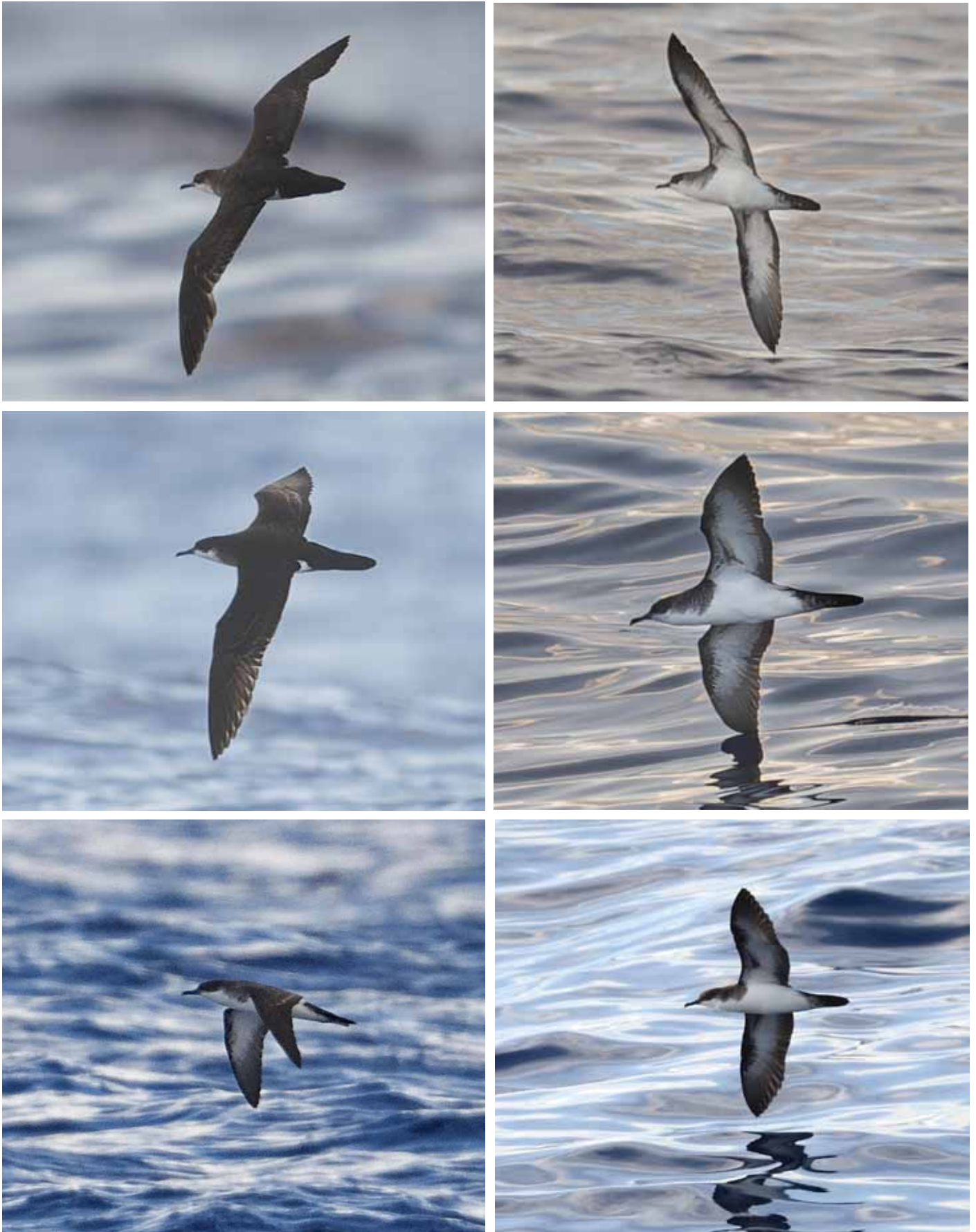
Figure 35. Puffinus shearwaters seen at Niuafu'ou, Tonga, on 11 May 2022 (top two rows Kirk Zufelt, bottom row Hiroyuki Tanoi). At least a dozen birds were seen close to the island and all reasonable quality photographs taken that day included here. Top-left bird recently commenced primary moult and lacks pale tips to upperwing greater secondary coverts. Bottom-left bird presumably with fresh plumage as upperwing greater secondary coverts clearly white-tipped forming a pale pencil line across the inner wing (apparently same centre-left bird). Right-hand column shows underwing-coverts and face markings consistent between birds. Lateral undertail-coverts dark in all cases, with variable dark smudgy markings in undertail-coverts.