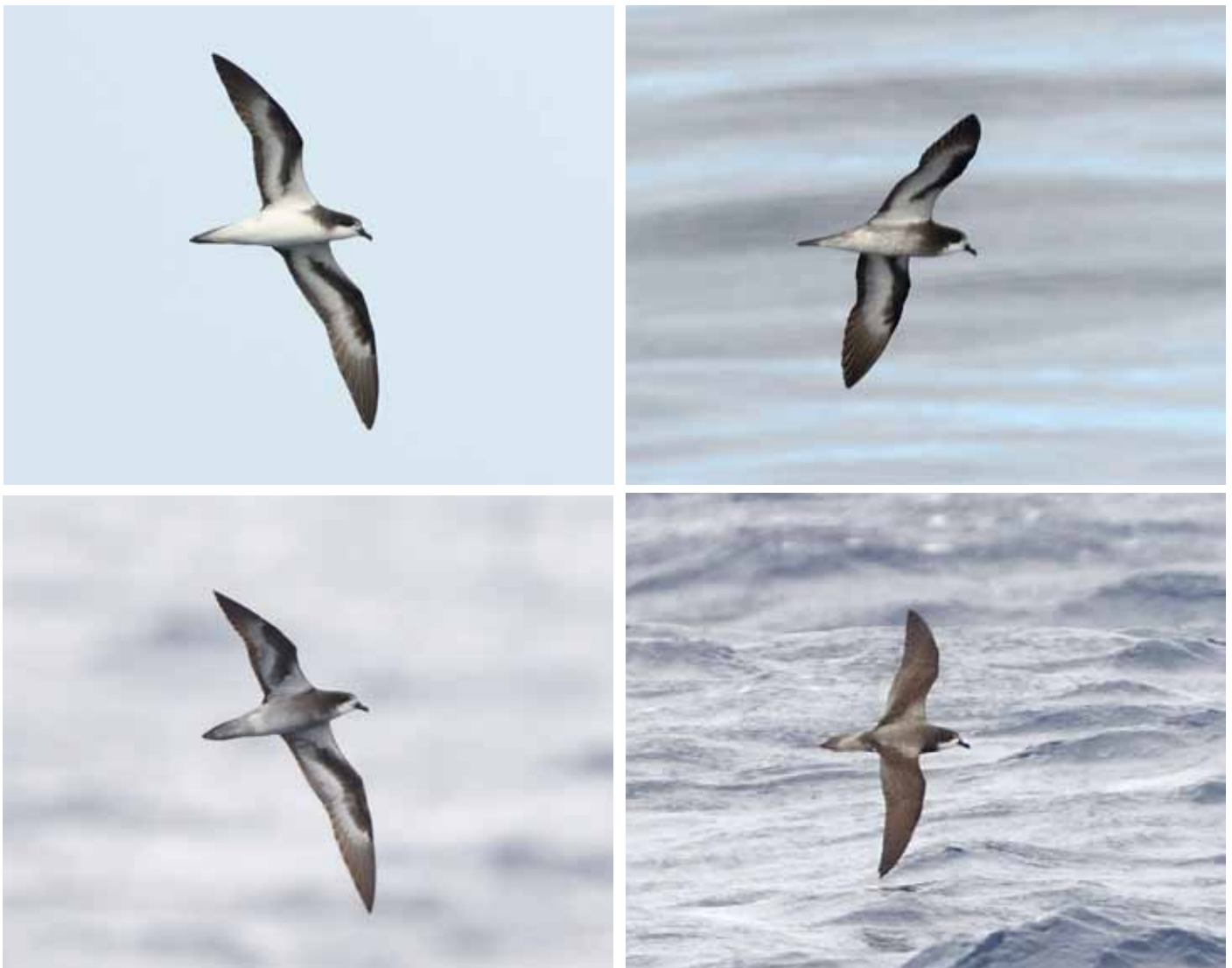
Figure 18. Collared Petrels Pterodroma brevipes , 26–29 May 2022, off Gau, Fiji. Pale (top left), intermediate (top right), and dark (bottom left) morphs, with little variation on upperside (bottom right).

Conservation Vulnerable (IUCN Red List of Threatened Species).