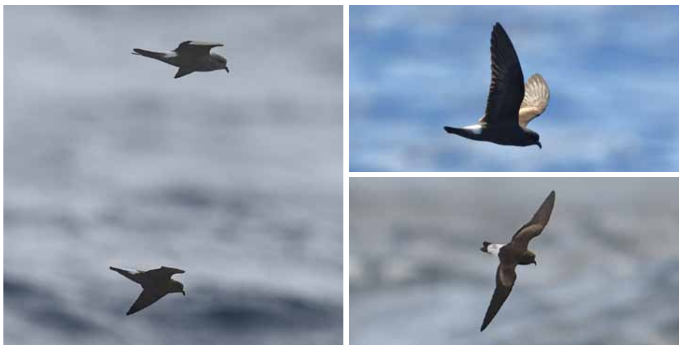
Figure 9. Band-rumped Storm-Petrel Hydrobates castro sp., 08 May 2022, day 3 sailing west-southwest from Kiritimati to Phoenix Islands, ca. 10.50°S, 174.75°W (top right). Leach’s Storm-Petrel Hydrobates leucorhous (top left) and Wedge-rumped Storm-Petrel Hydrobates tethys (bottom left and right) 23 April 2022, north of Kiritimati, ca. 4°N, 157°W. Two cryptic taxa picked out from the Leach’s.

Conservation Least Concern (IUCN Red List of Threatened Species) does not reflect evidence that complex comprises numerous populations, of which several small and declining. Treated separately, some populations undoubtedly Endangered or Critically Endangered (e.g., catastrophic decline Japanese population).