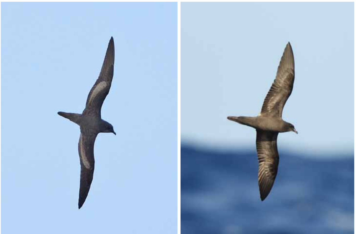
Figure 22. Bulwer’s Petrels Bulweria bulwerii , 20 April 2022, day 3 sailing south from Hawaii to Kiritimati ( Hiroiyuki Tanoi ). The population in the Phoenix Islands has undergone a catastrophic decline, but the small number of them that we logged appeared notably larger than the birds shown here north of Kiritimati.

Conservation Least Concern (IUCN Red List of Threatened Species). Possibly involves cryptic taxa / species, thus conservation status requires careful attention.