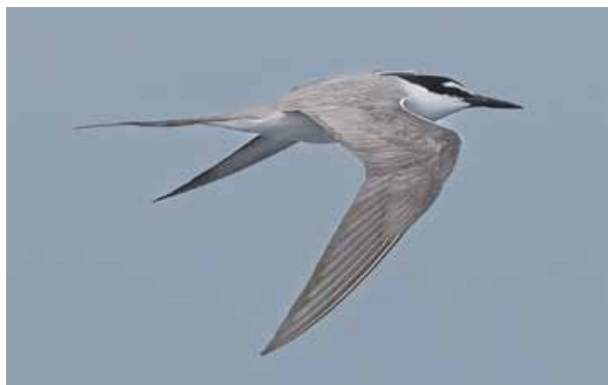
Figure 36. Blue Noddy Anous ceruleus. Most seen around Kiritimati and Rawaki. Figure 37. Grey-backed Tern Onychoprion lunatus. Exceptional numbers at Kiritimati.