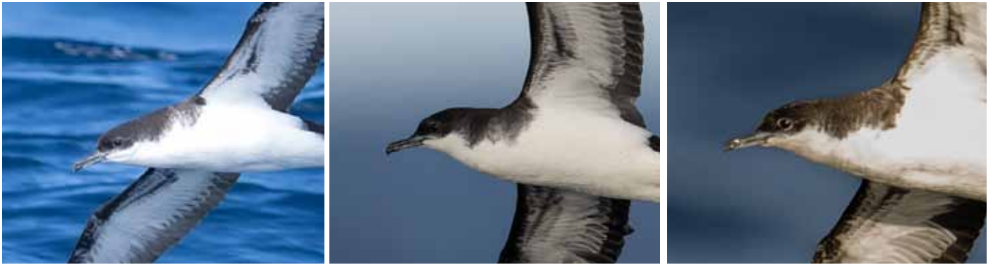
Figure 30. Face of Puffinus shearwaters from current expedition. Left off Kiritimati, centre and right off Rawaki. Face markings quite consistent across Kiritimati and Rawaki populations. Solidly dark cap with border running from just above gape line, under eye, to ear coverts, border straight in some birds, bulging beneath eye in others. Some had distinct pale eye-ring (right bird), partial on others (left bird), just a fragment on rest (centre bird). Also, complete or broken pale pencil line running behind eye.