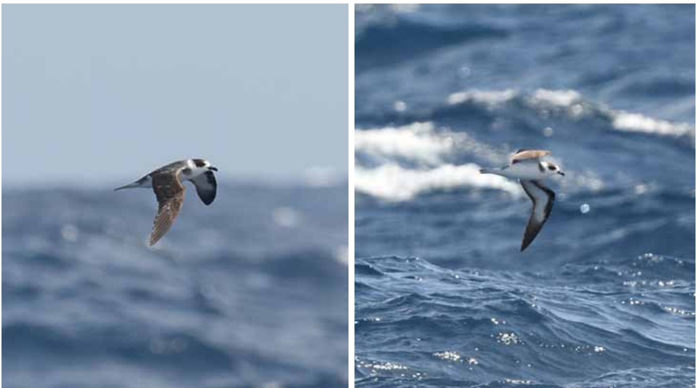
Figure 11. Vanuatu Petrel Pterodroma occulta , 22 April 2022, day 5 sailing from Hawaii to Kiritimati (left Kirk Zufelt, right Hiroyuki Tanoi). Size, structure, and plumage aspect separate this bird from White-necked Petrel.

Conservation IUCN lump Vanuatu Petrel with White-necked Petrel. White-necked Petrel classified Vulnerable (IUCN Red List of Threatened Species). Vanuatu Petrel treated alone probably Endangered.