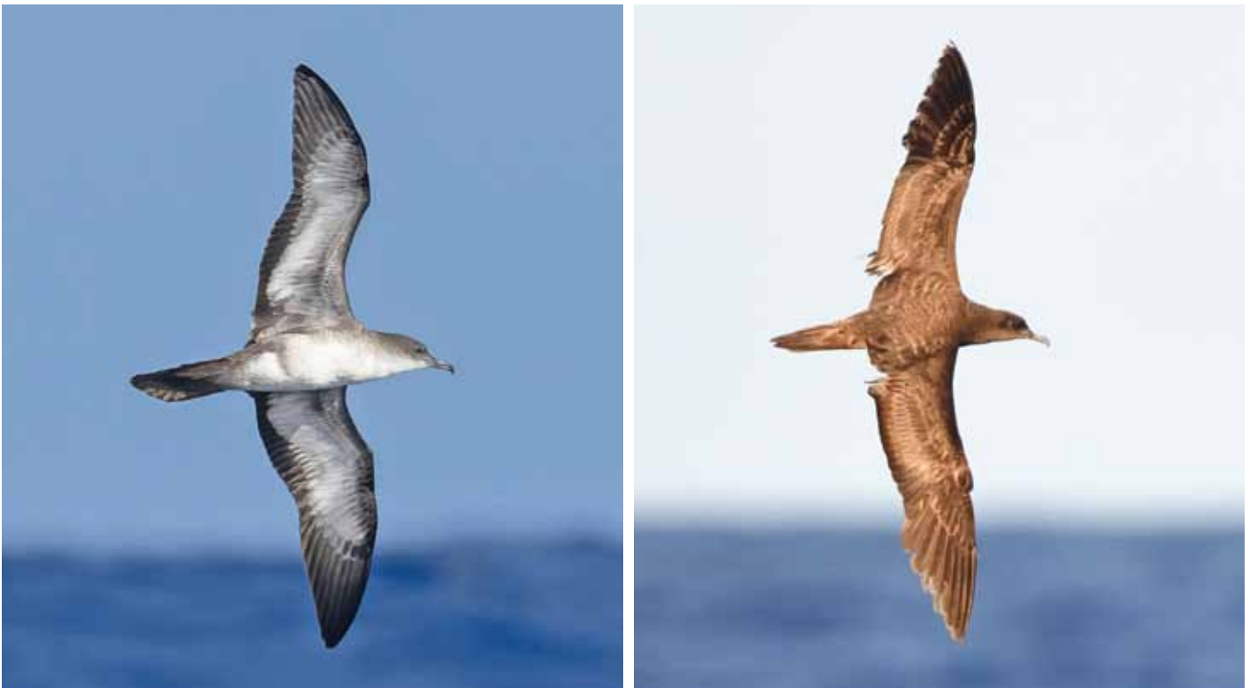
Figure 23. Wedge-tailed Shearwaters Ardenna pacifica ; (left) light morph, 19 April 2022, day 2 sailing south from Hawaii to Kiritimati ( Kirk Zufelt ); (right) dark morph, 8 May 2022, day 3 sailing southwest from Phoenix Islands to Niuafo'ou, Tonga ( Hiroyuki Tanoi ). Predominantly light morph for the first three days sailing south from Hawaii to Kiritimati, sudden switch to dark morph shortly thereafter. Notable northward passage 04–06 May, less intense 07–08 May, of worn and moulting dark-morph birds (shown here).

Conservation Least Concern (IUCN Red List of Threatened Species).