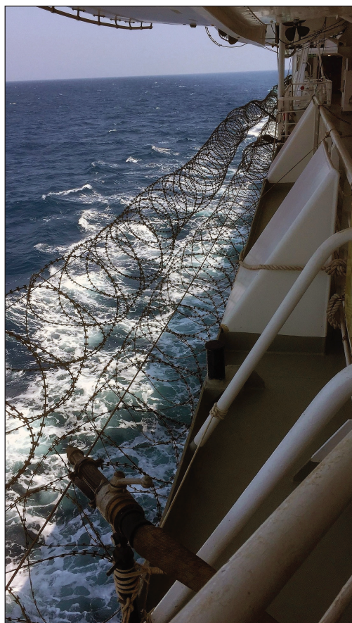
Plate 1. MV Minerva dressed in rolls of razor wire and numerous water cannons as part of the defence against the threat of Somali pirates, April 2015.

This individual was recognised as one of the four Calonectris species; being a large shearwater, broad winged, with scruffy brown and white plumage. Streaked C. leucomelas , Cory's and Scopoli's C. diomedea Shearwaters have been recorded in waters around the Arabian peninsula, while Cape Verde Shearwater C. edwardsii has not. It was identified as Cory's Shearwater by its brownish head and neck, whitish chin and throat, distinct border