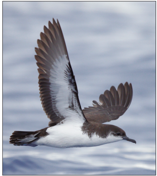
Plate 4 (left). Tropical Shearwater Puffinus b. bailloni off Réunion island, southwest Indian ocean, 10 December 2014.