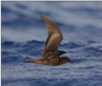
Plate 10 (above left). Jouanin's Petrel Bulweria fallax off Oman, 15 September 2014.