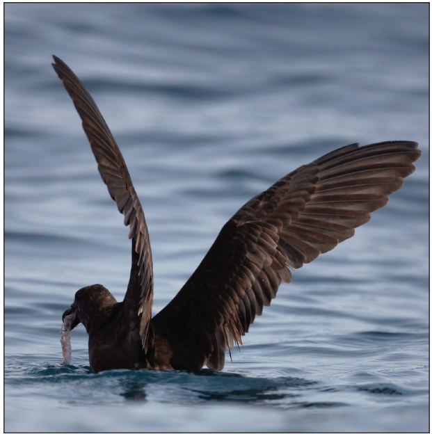
Plate 8 (left). Jouanin's Petrel Bulweria fallax off Muscat, Oman, November 2014. Adult showing the start of wing moult.