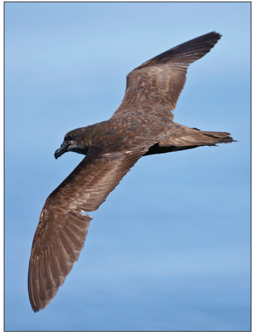
Plate 6 (left). Jouanin's Petrel Bulweria fallax off Oman, 8 November 2011. Fresh-looking presumed juvenile. Note the indistinct pale upperwing ulnar bars.