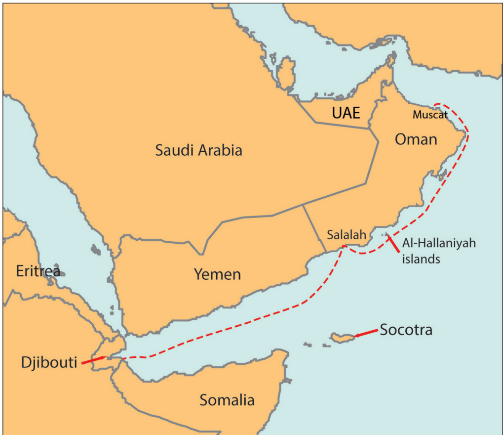
Figure 1. Route of MV Minerva, Muscat–Djibouti, March/April 2015.

This note documents sightings and identification criteria for Cory's Shearwater Calonectris borealis , Persian Shearwater Puffinus persicus and Jouanin's Petrel Bulweria fallax , the three Procellariiformes sighted during a 'cultural cruise' aboard MV Minerva, March/April 2015. Identification criteria for Jouanin's Petrel are extended to include new insights. Sightings of Red-necked Phalarope Phalaropus lobatus are also given. The cruise travelled from Muscat, Oman, to Djibouti, northeast Africa, by way of the gulfs of Oman and Aden (Figure 1, Table 1). It then continued to Aqaba, Jordan, through the Red sea and gulf of Aqaba, though the four featured species were not recorded on this leg of the journey. The route passed c8 kilometres south of the Al-Hallaniyat (Al-Hallaniyah) islands, which are