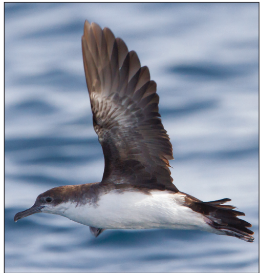
Plate 2 (left). Persian Shearwater Puffinus p. persicus off Oman, 9 September 2011.